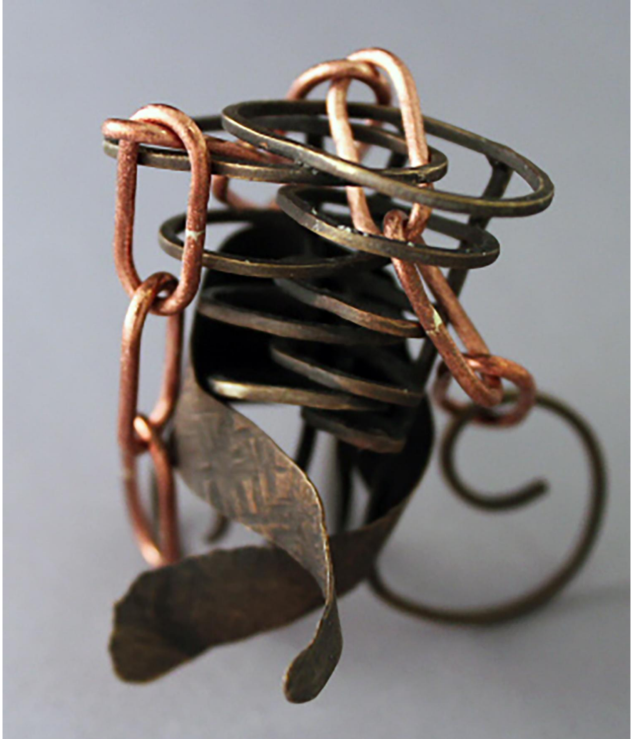
La Torse | Copper patinated with liver of sulfur | May 2022