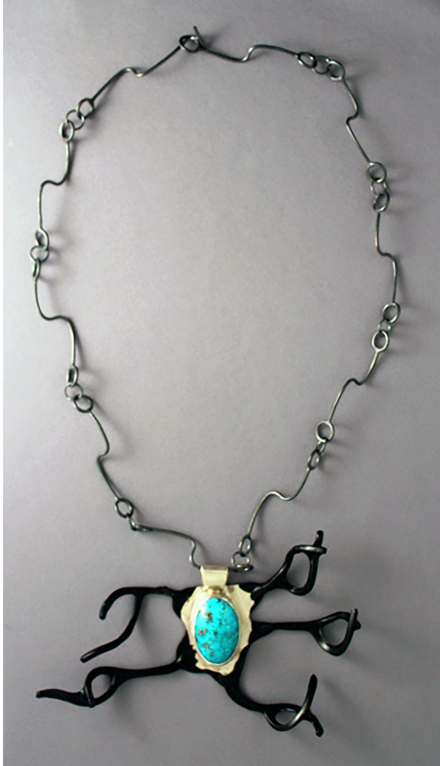
Creep| Silver, turquoise, plasti-dip, brass | November 2021