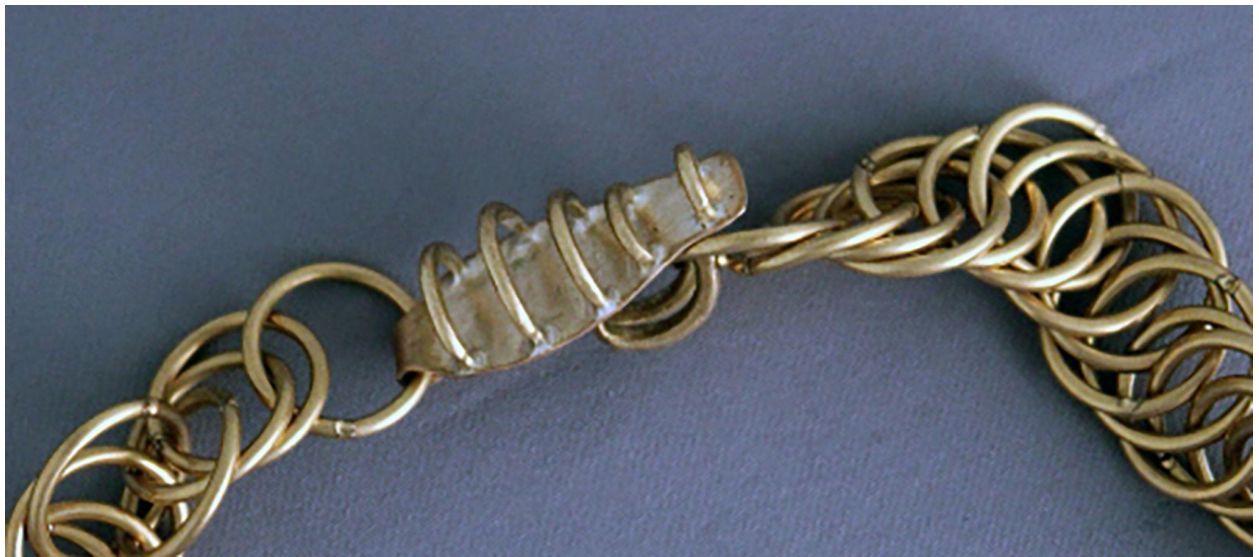
Boa | Brass | March 2022