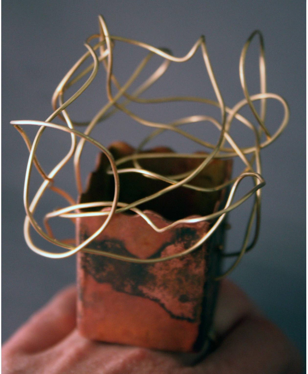
Train of Thought | Heat-patinated copper, brass | February 2020