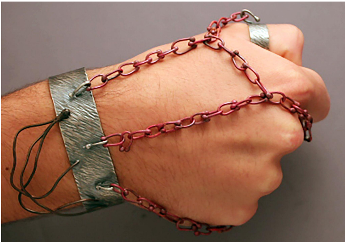
Grasp | Silver, copper | March 2022