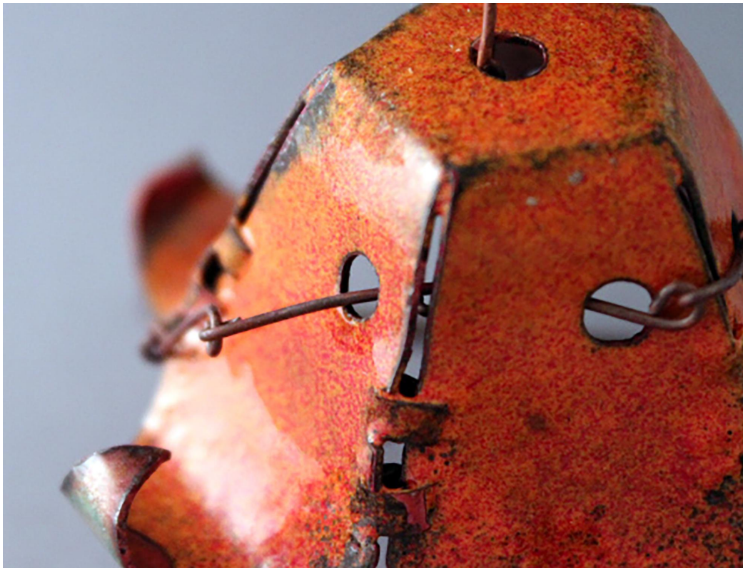
Gallows Lily | Copper, enamel | January 2022