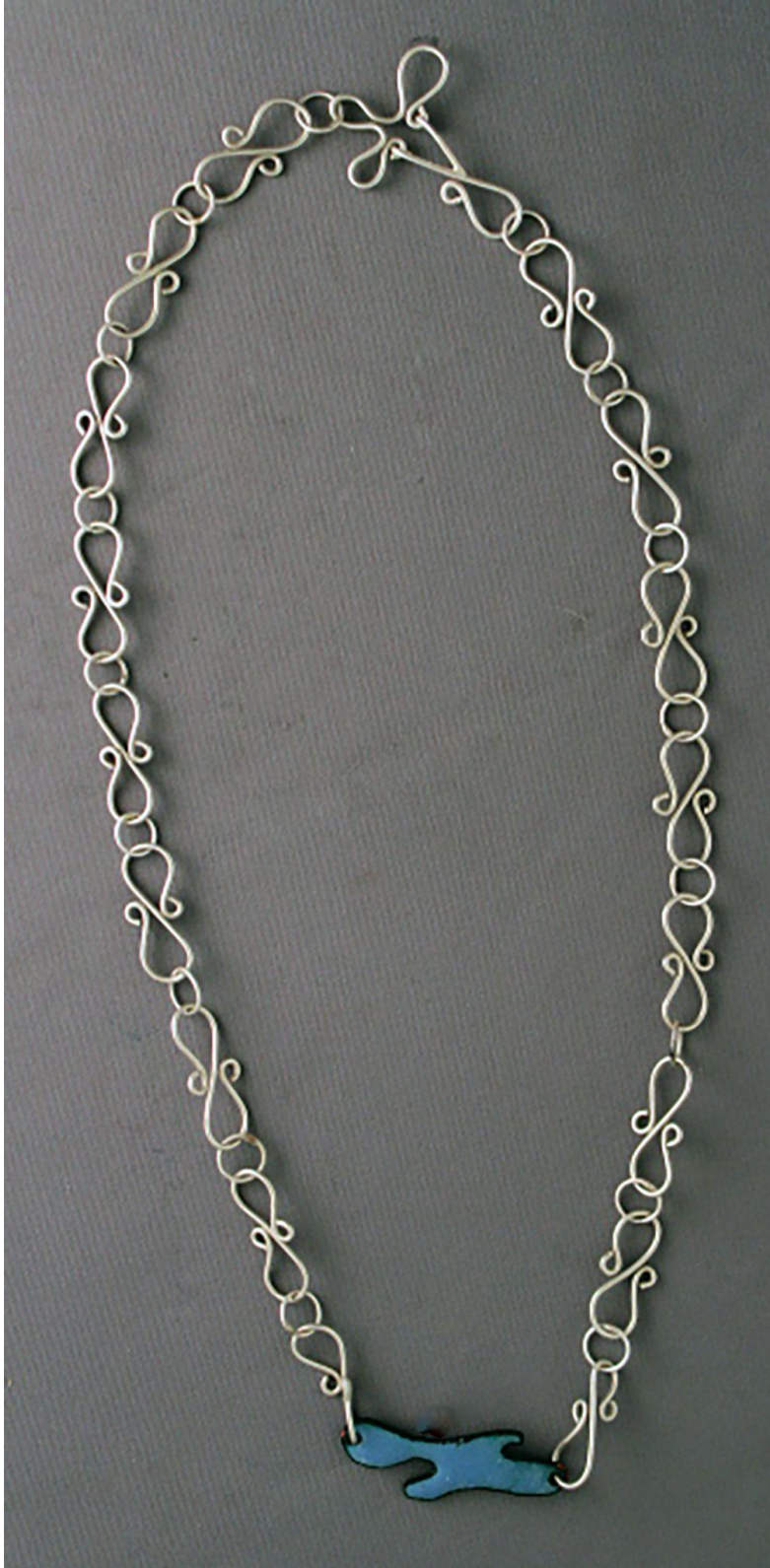
Untitled | Silver, copper, enamel | January 2022