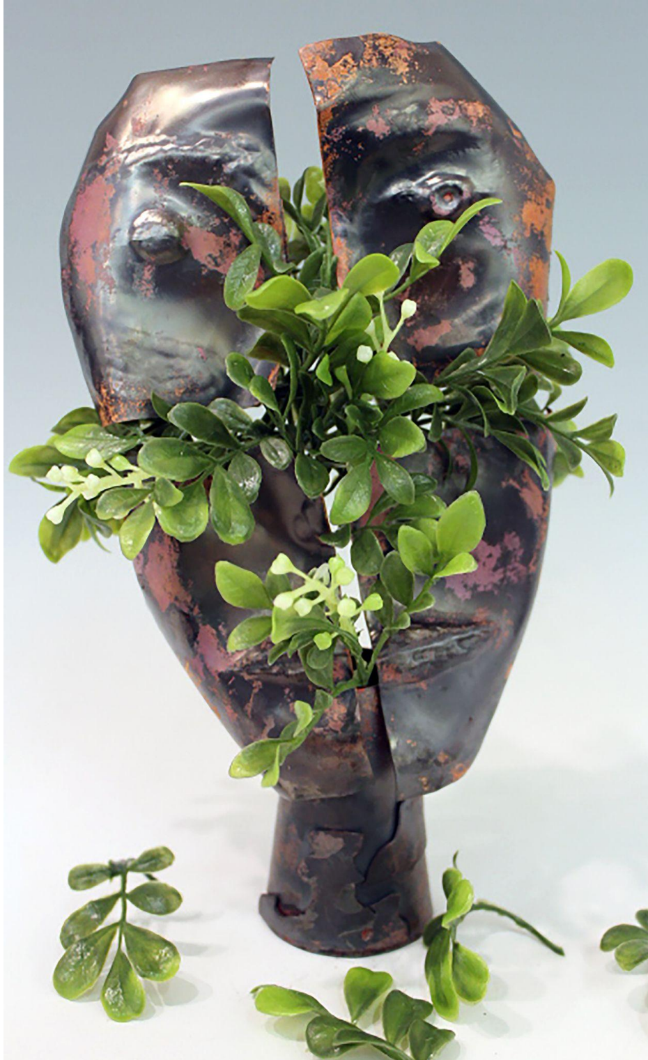
Through the Cracks | Heat-patinated copper, artificial leaves | November 2022