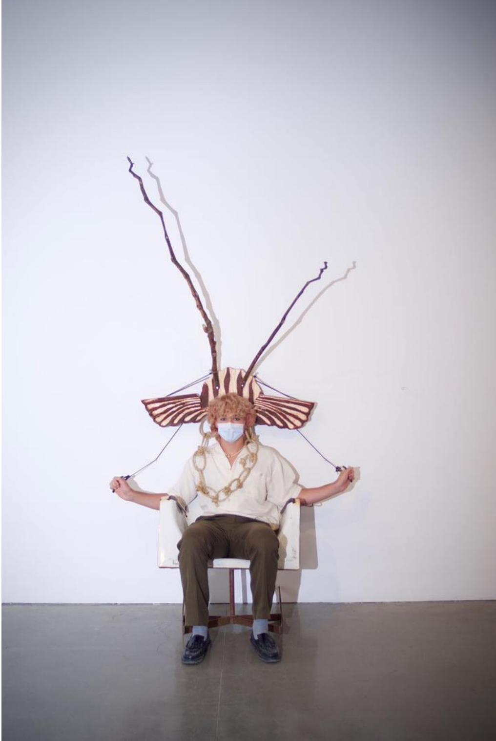
Little Wing | Wood, steel, paracord, bathtub, branches, iron | July 2022 | Exhibited at UCLA's New Wight Gallery