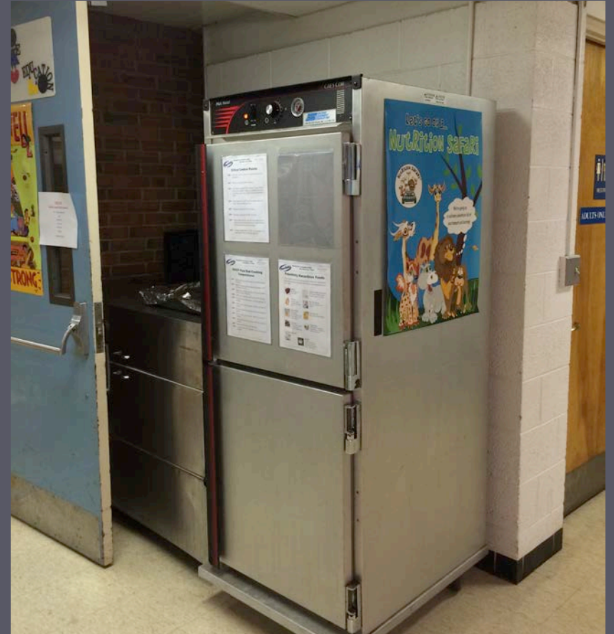
Food Service Storage