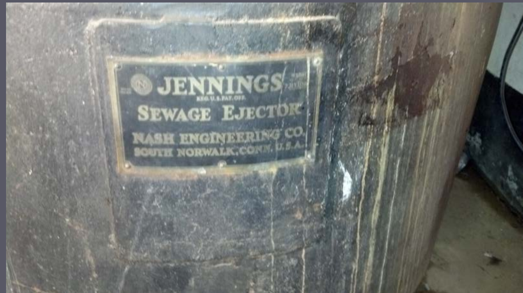
Schofield Sewage Ejector Pump