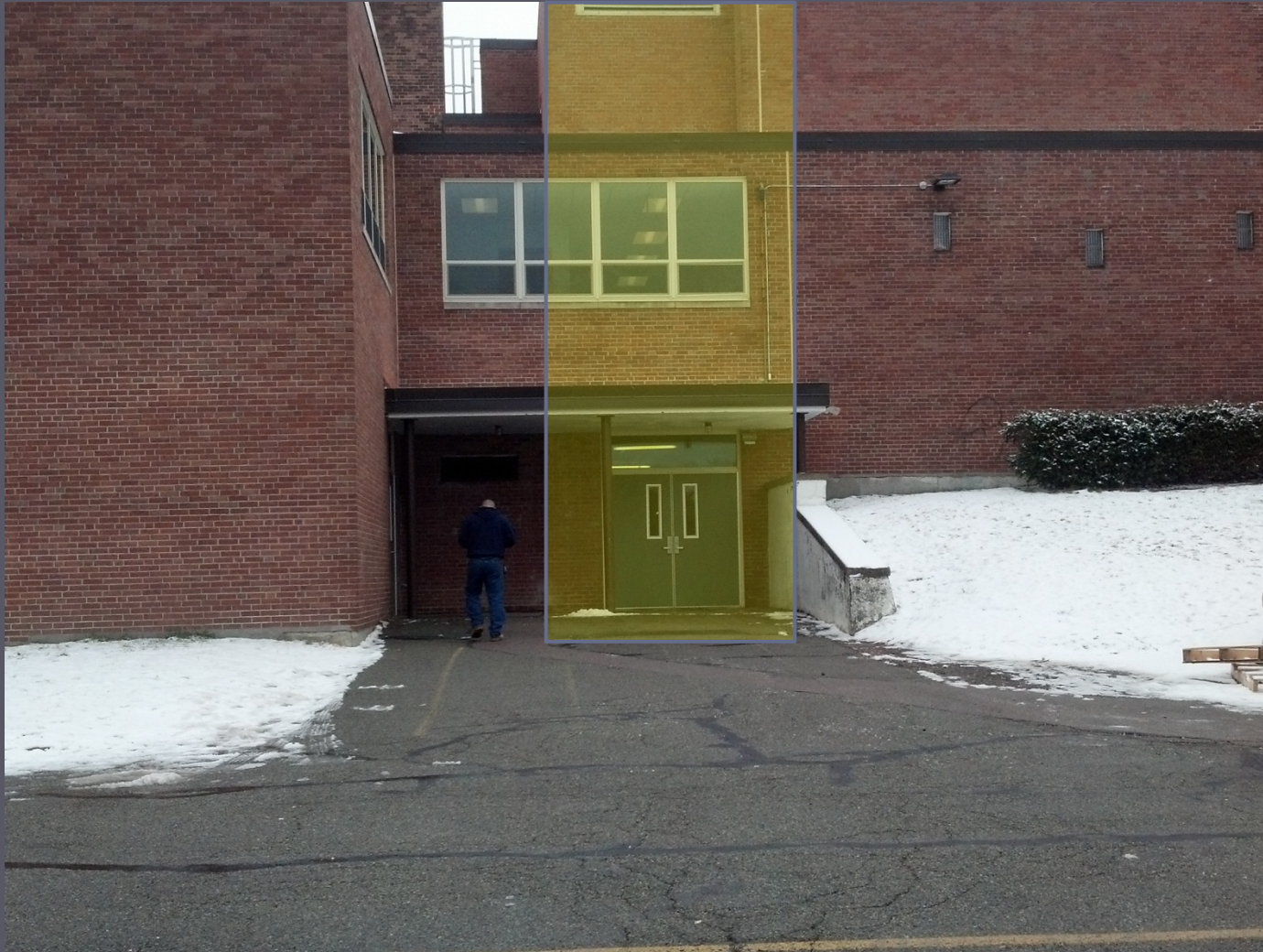
FISKE: New Elevator