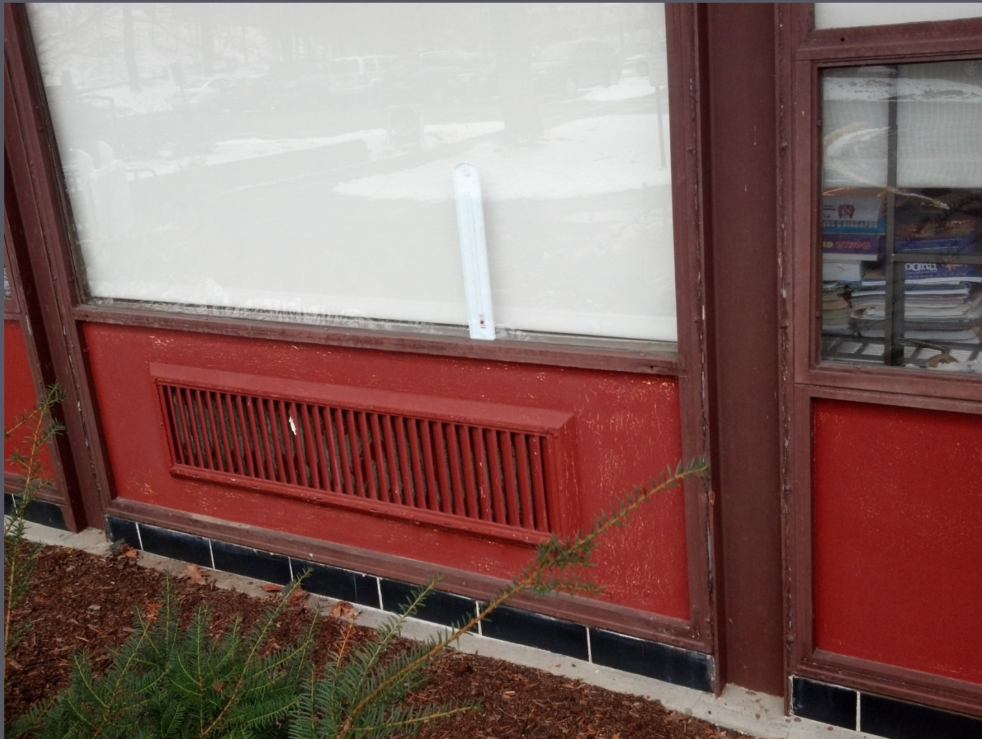
SCHOFIELD: Window Replacement