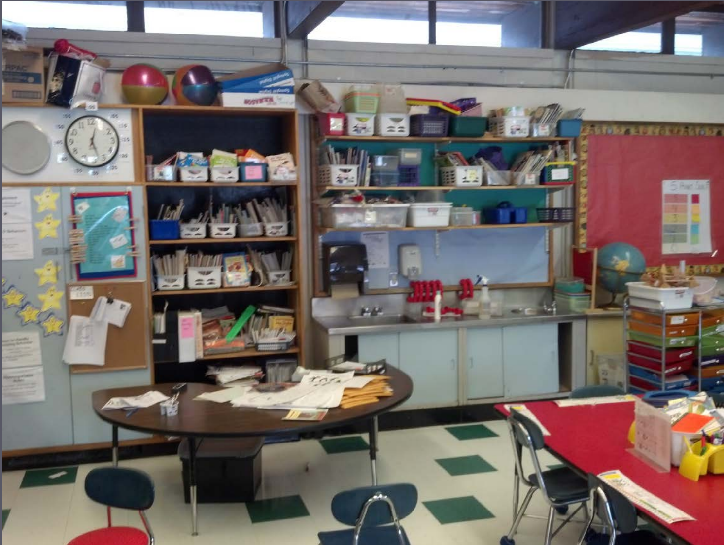
Classroom Cabinetry Replacement