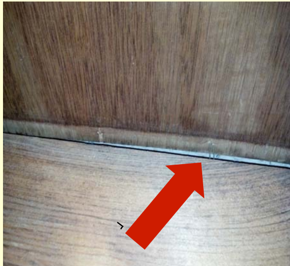
Poor quality-notice shelf is separating from back; nails