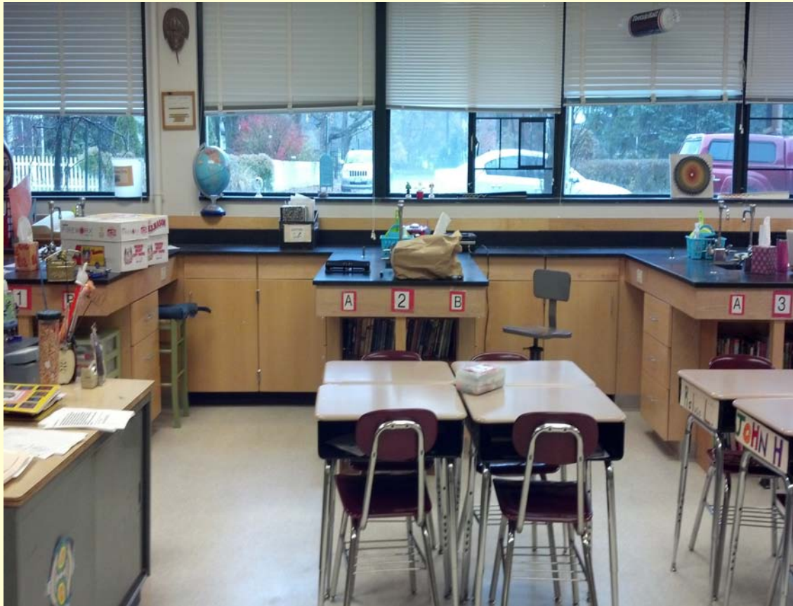
Typical Science Lab